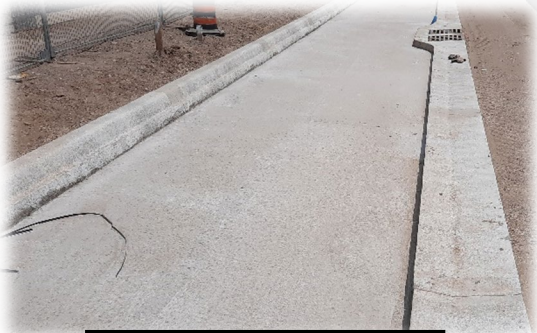
Concrete Lay-by ready for brick pavers to be placed.